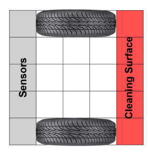
Figure 1: Simplification of the window cleaning robot

The robot is assumed to have a square shape and covers an area of 5 \times 5 patches, which thus equals an area of 250 \times 250 \ mm . These dimensions are very similar to the current commercially available window cleaning systems such as the Hobot, Windoro and Winbot (see Appendix A). Because this project considers the motion planning algorithms and not the particular geometry of the robot, the geometry of the robot needed to be set as fixed. Which means that the variables relating to this geometry are removed from the problem. The bottom side of the robot is divided in 5 \times 5 squares, see Figure 1.